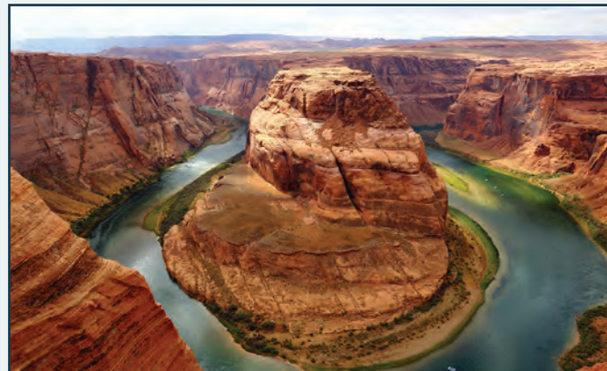
Horseshoe Bend on the Colorado River, USA

Get ready to embark on a schooling experience like no other, where you'll immerse yourself in the vibrant American culture, forge lifelong connections, and expand your horizons in the land of endless possibilities. The United States of America eagerly awaits your arrival as an exchange student, ready to offer you an extraordinary educational adventure.