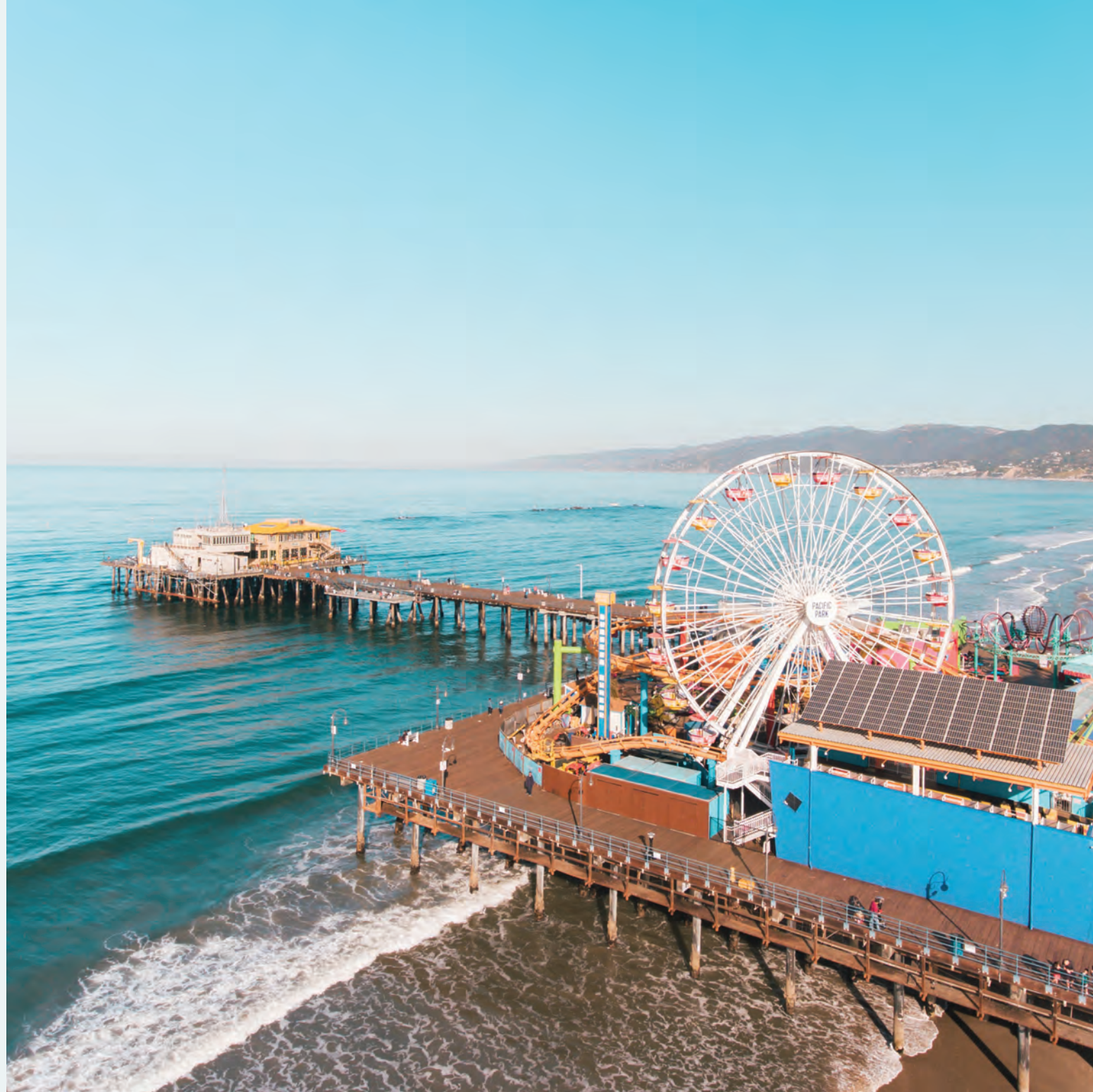
Santa Monica pier, California